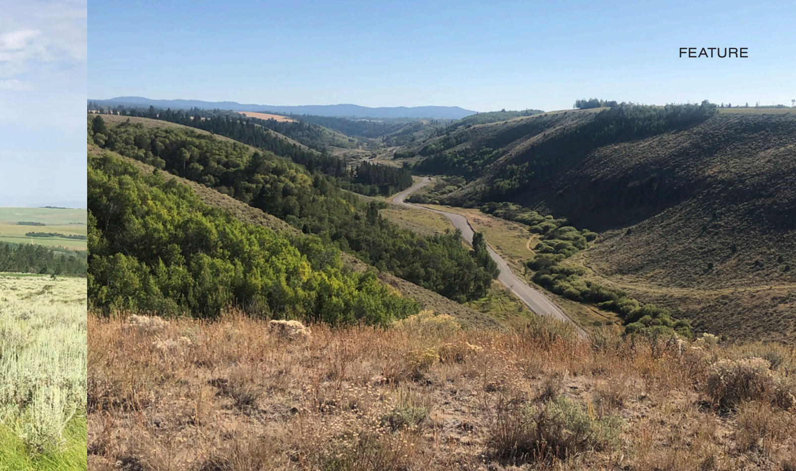
Lazy Triple Creek Ranch is located in Idaho's Teton Valley