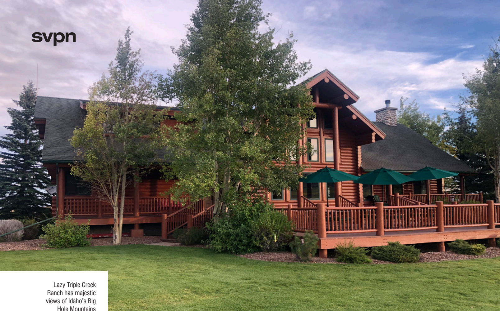
Lazy Triple Creek Ranch has majestic views of Idaho's Big Hole Mountains

minutes of the lodge. A little over an hour away, the mountain biker, hiker, photographer, and wildlife viewer can enjoy the Jackson Hole area with its picturized peaks and mountain lakes. The same for access to Yellowstone National Park and Grand Teton National Park. And, of course, for the addictive shopper and cuisine lover Jackson Hole is also a mecca for art galleries, shopping, and famous restaurants and historical bars.